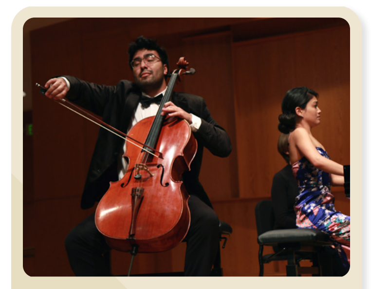
Student Recitals Free, no tickets required