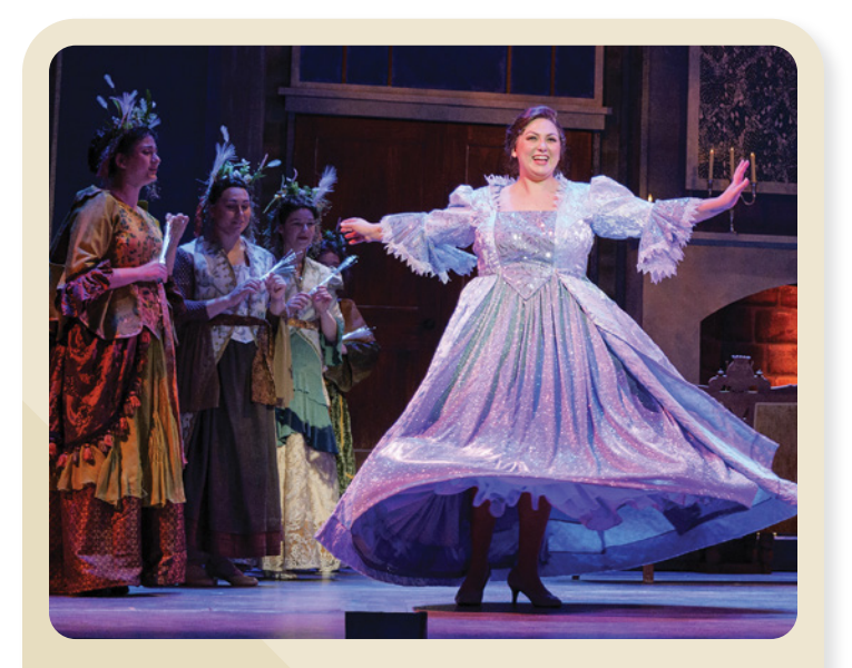
Eklund Opera Tickets start at $15