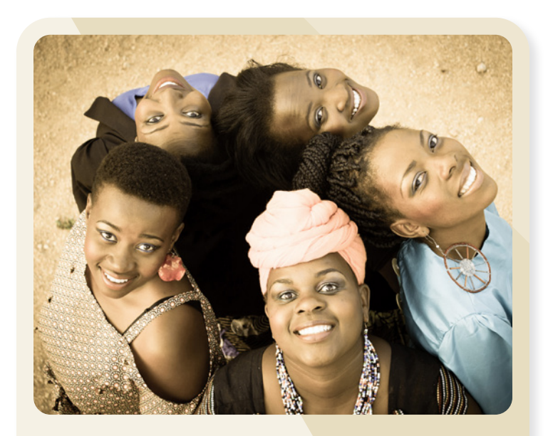
Artist Series Tickets start at $20

Event details are subject to change, but the CU Presents website will always be up to date. Click or tap below to explore your options.