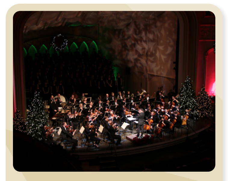
Holiday Festival Tickets start at $23