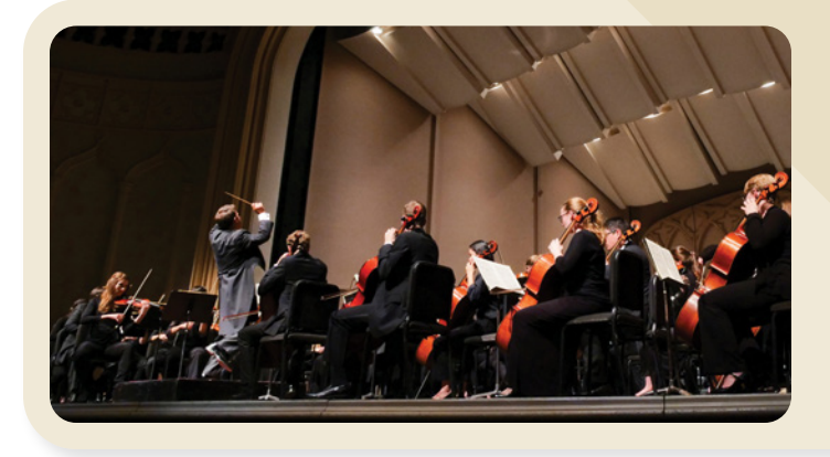
Click or tap to visit the College of Music website at colorado.edu/music