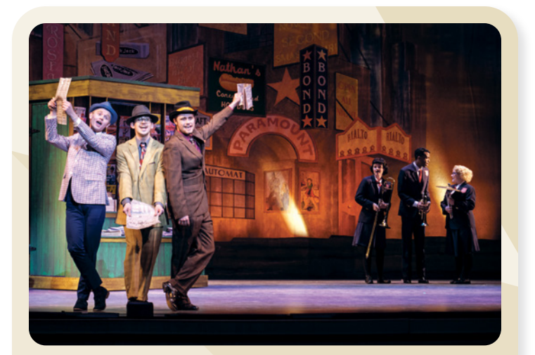
Bachelor of Music in Musical Theatre Program Tickets start at $17