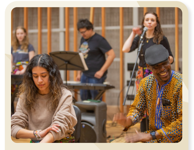
Educational Events Free, reservation requirements vary