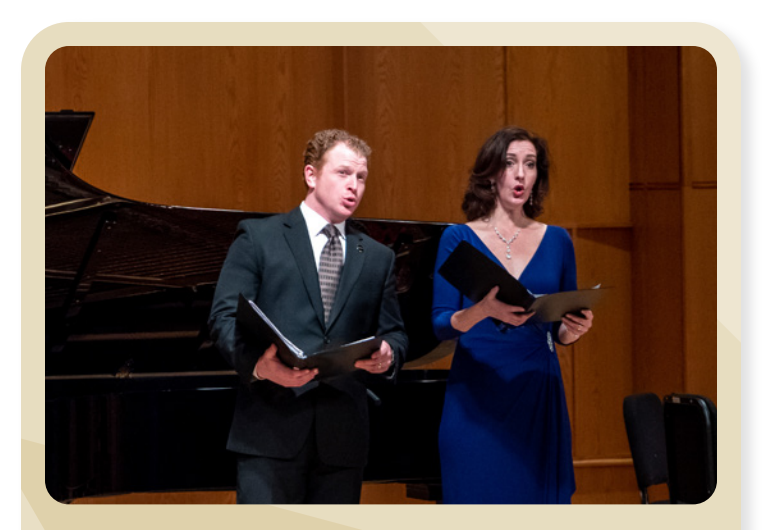
Faculty Tuesdays and Guest Artist Recitals Free, no tickets required