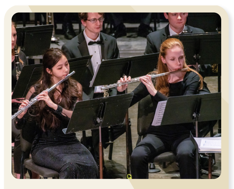
Student Ensembles Free, no tickets required