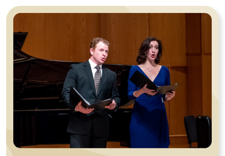
Faculty Tuesdays and Guest Artist Recitals Free, no tickets required