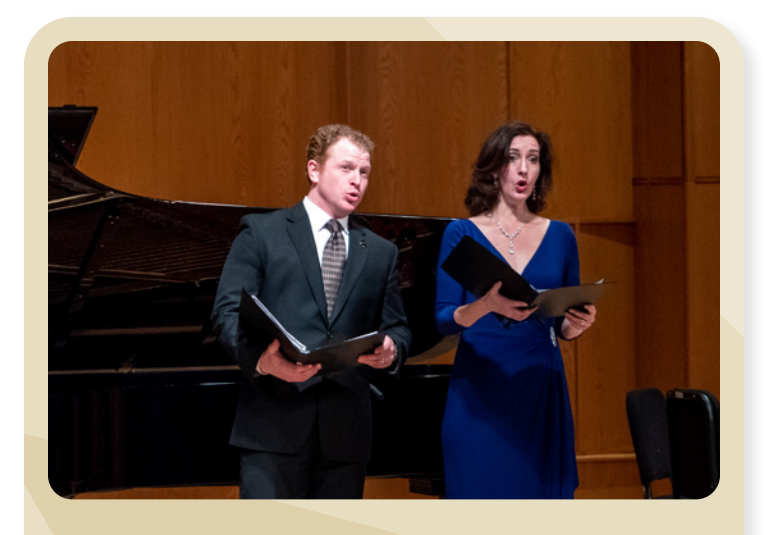
Faculty Tuesdays and Guest Artist Recitals Free, no tickets required