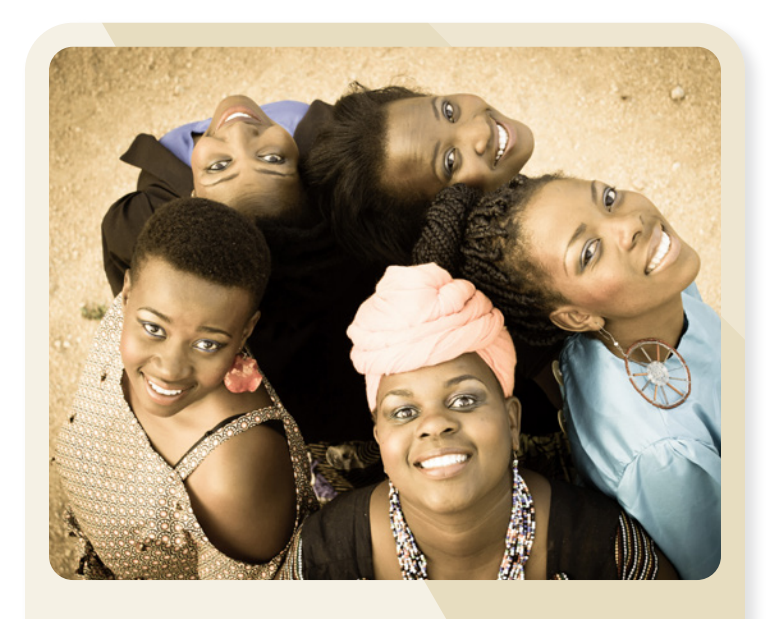
Artist Series Tickets start at $20

Event details are subject to change, but the CU Presents website will always be up to date. Click or tap below to explore your options.