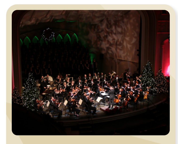
Holiday Festival Tickets start at $23