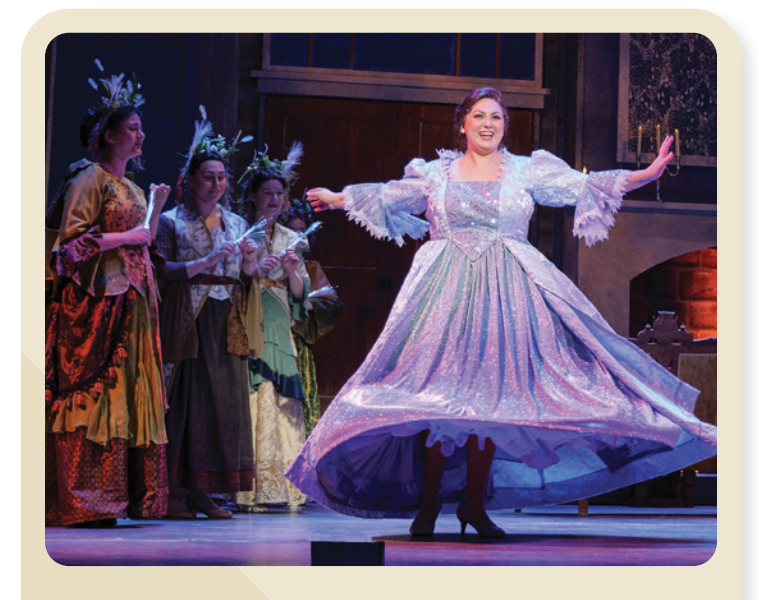
Eklund Opera Tickets start at $15