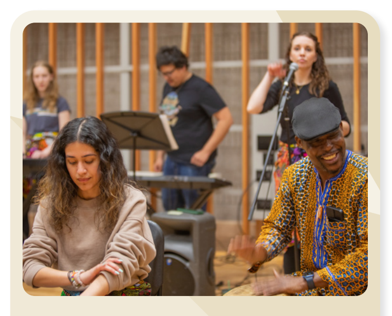
Educational Events Free, reservation requirements vary