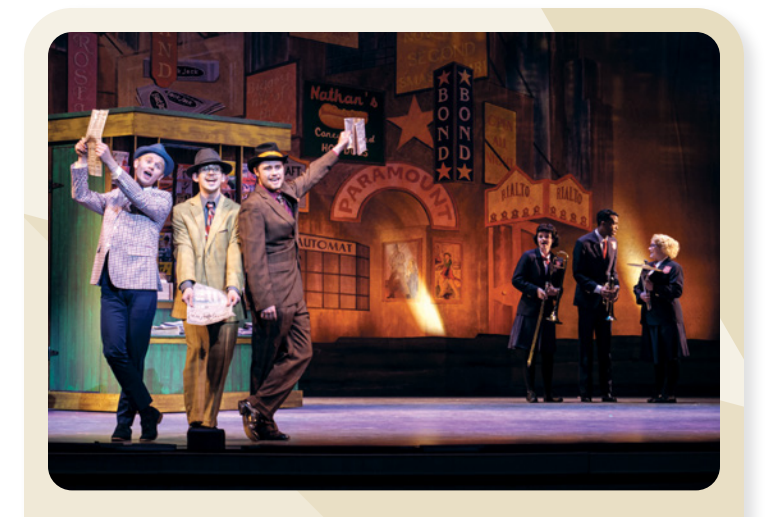
Bachelor of Music in Musical Theatre Program