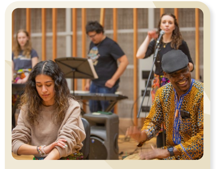
Educational Events Free, reservation requirements vary