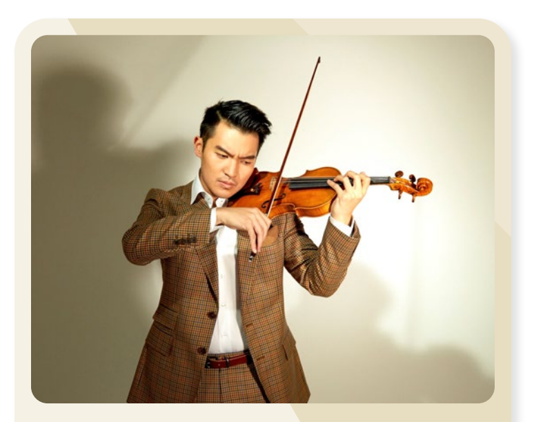
Artist Series Tickets start at $20

Event details are subject to change, but the CU Presents website will always be up to date. Click or tap below to explore your options.