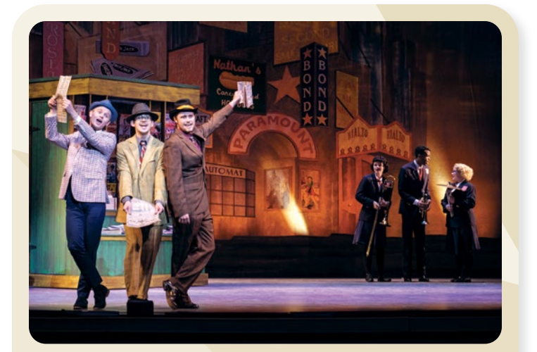
Bachelor of Music in Musical Theatre Program Tickets start at $17