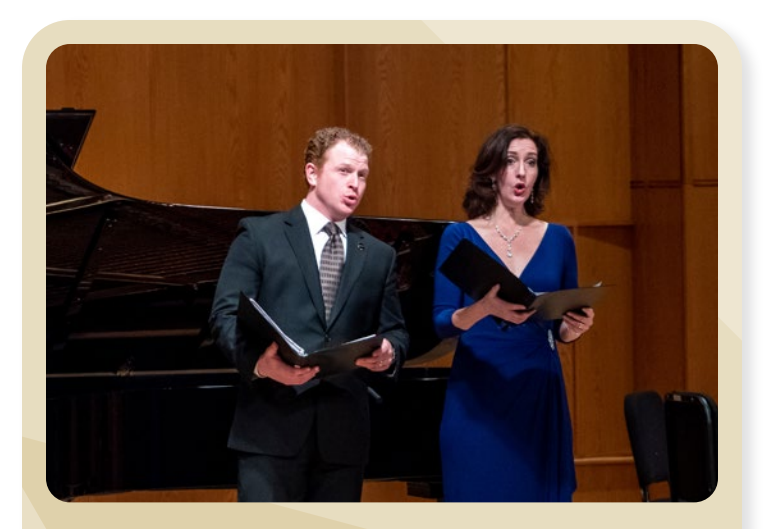
Faculty Tuesdays and Guest Artist Recitals Free, no tickets required