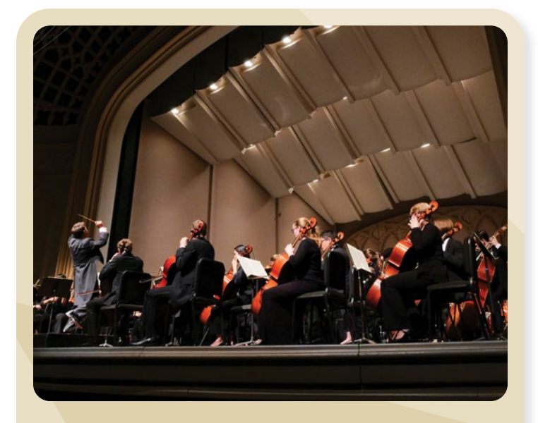
Visit the College of Music website