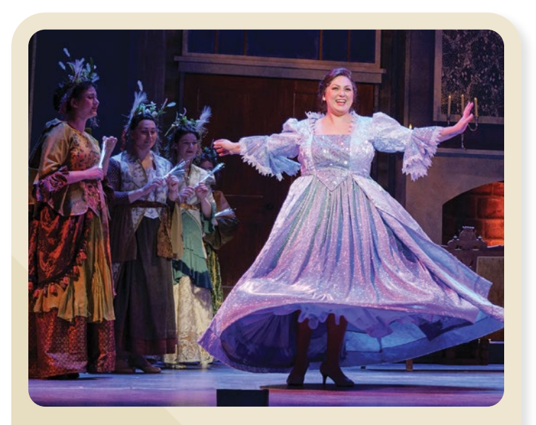
Eklund Opera Tickets start at $15