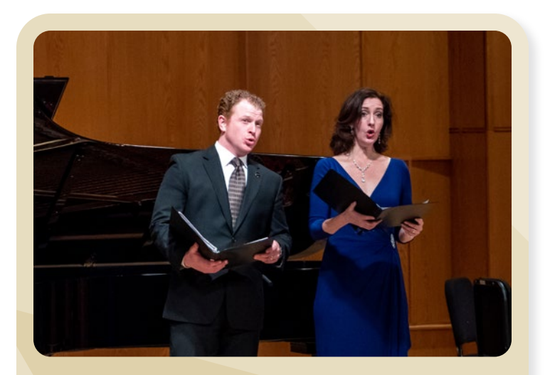
Faculty Tuesdays and Guest Artist Recitals Free, no tickets required