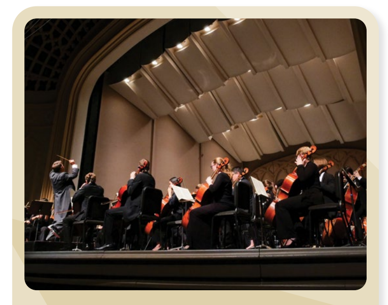
Visit the College of Music website