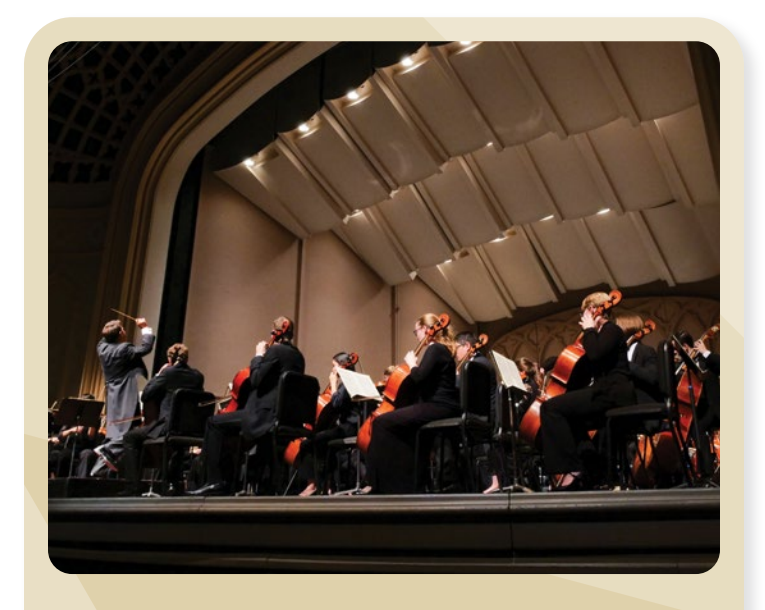
Visit the College of Music website