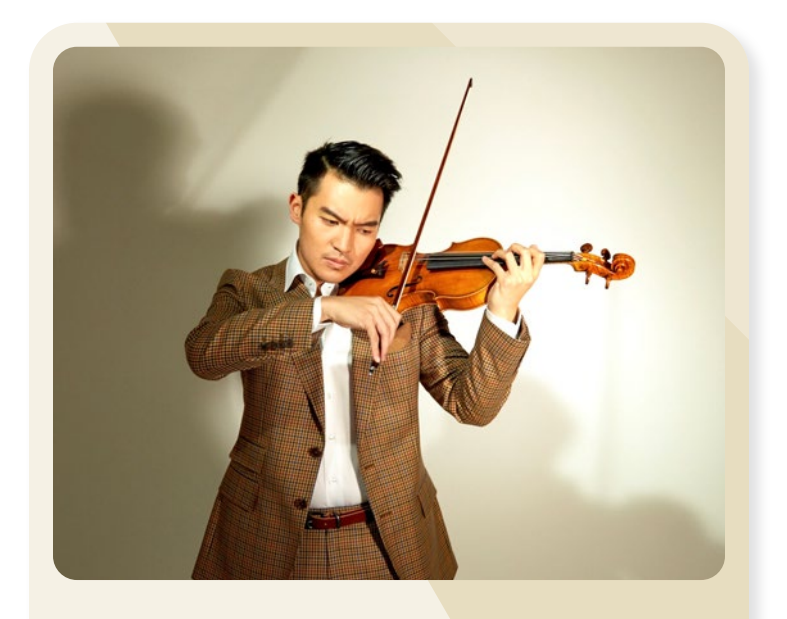
Artist Series Tickets start at $20

Event details are subject to change, but the CU Presents website will always be up to date. Click or tap below to explore your options.