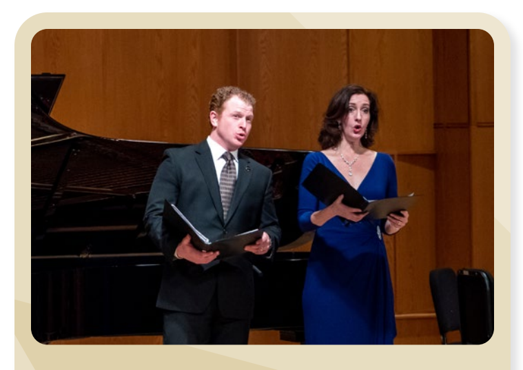
Faculty Tuesdays and Guest Artist Recitals Free, no tickets required