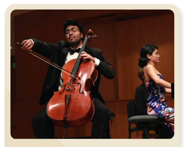
Student Recitals Free, no tickets required