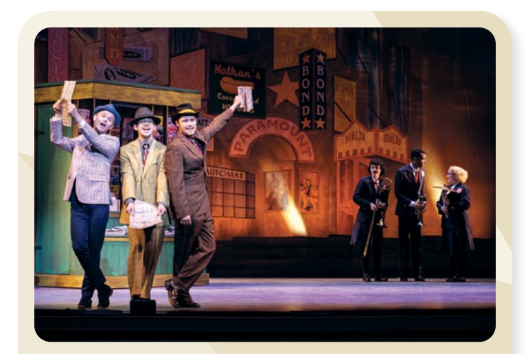
Bachelor of Music in Musical Theatre Program Tickets start at $17