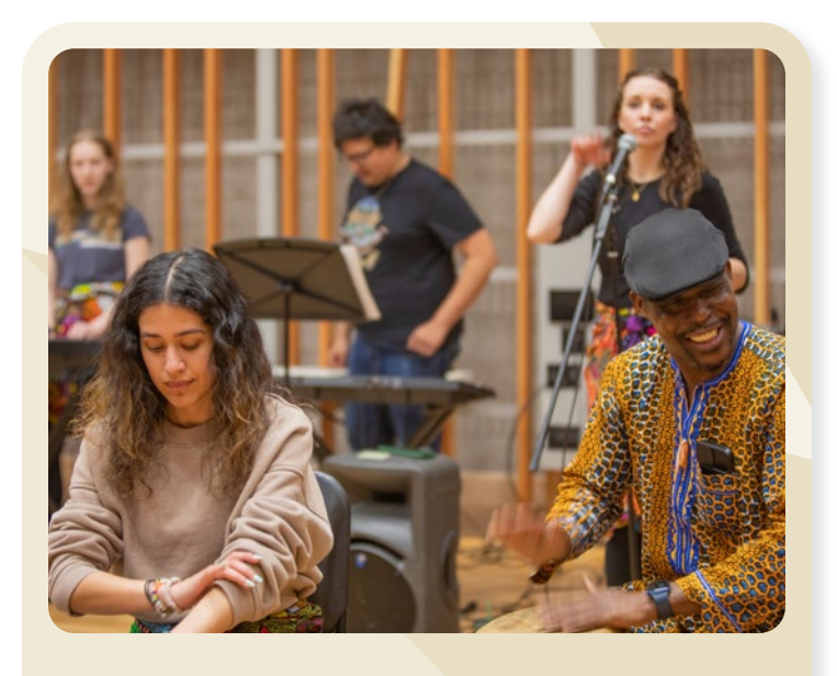
Educational Events Free, reservation requirements vary