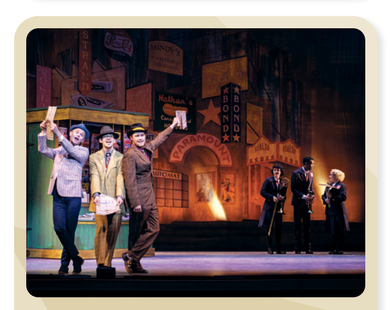
More recommendations Ticket prices vary