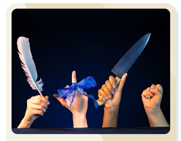
Theatre events Tickets start at $20

Event details are subject to change, but the CU Presents website will always be up to date. Click or tap below to explore your options.