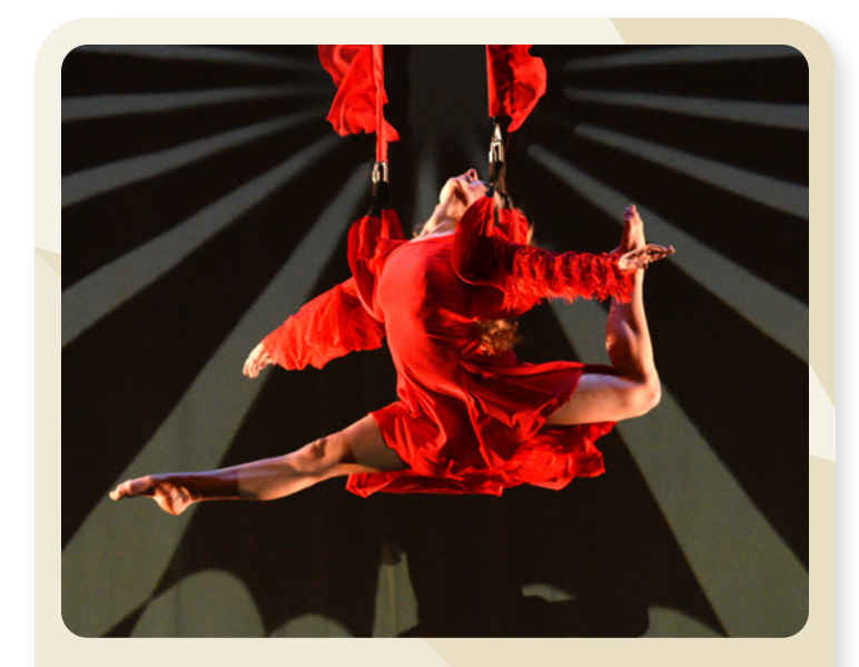
Artist Series Tickets start at $20