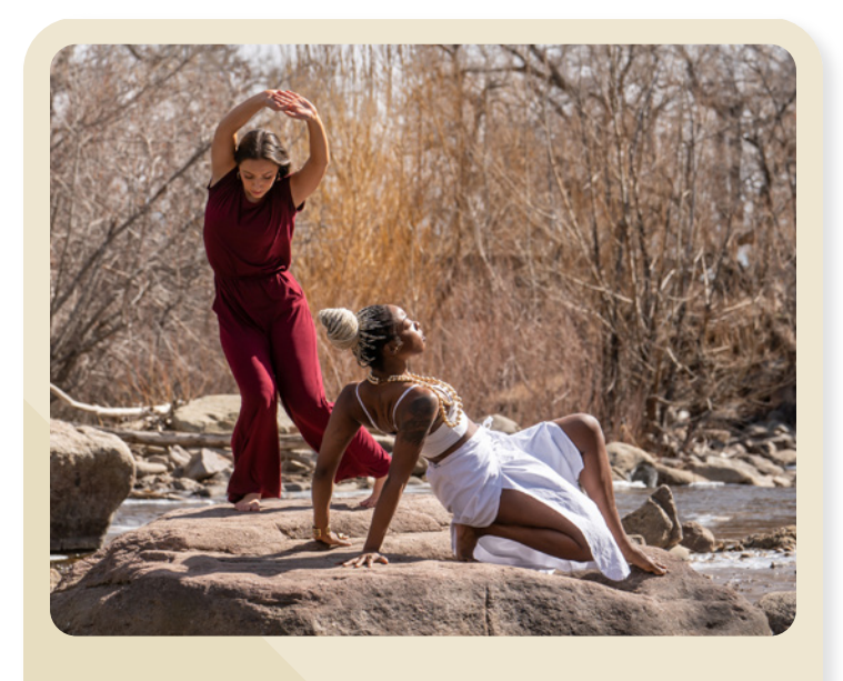
Dance events Ticket prices vary