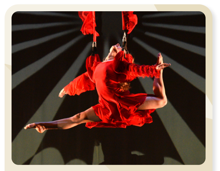
Artist Series Tickets start at $20