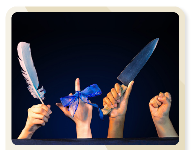
Theatre events Tickets start at $20

Event details are subject to change, but the CU Presents website will always be up to date. Click or tap below to explore your options.