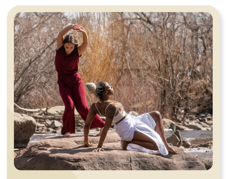
Dance events Ticket prices vary