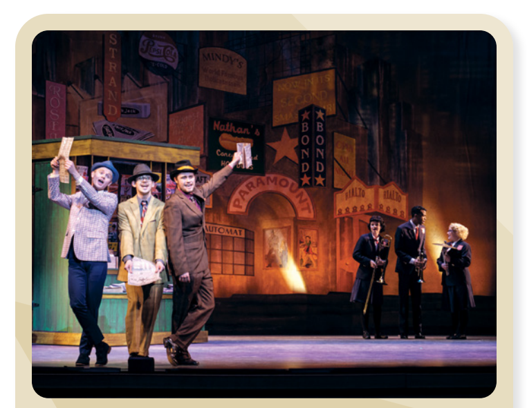
More recommendations Ticket prices vary