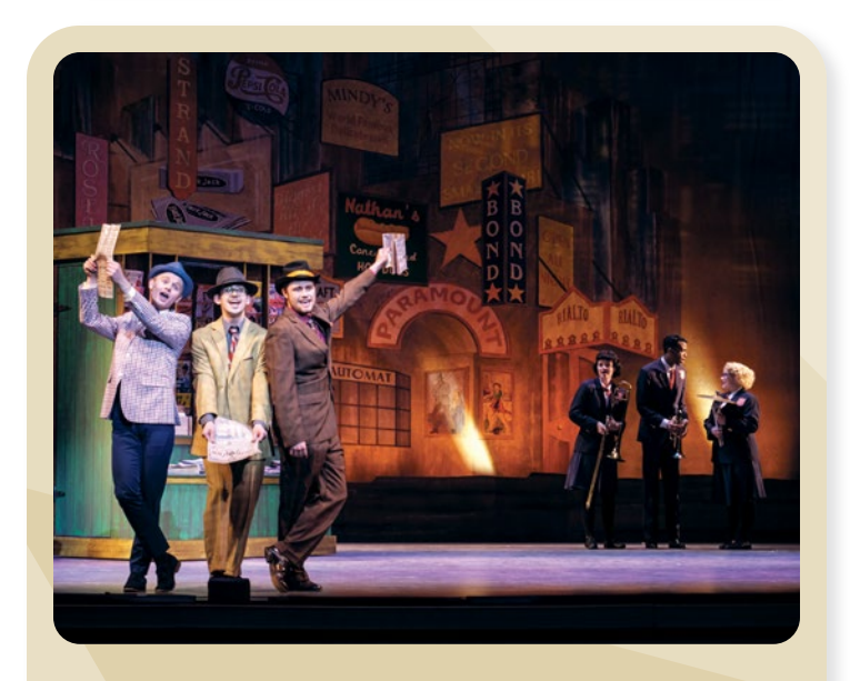
More recommendations Ticket prices vary