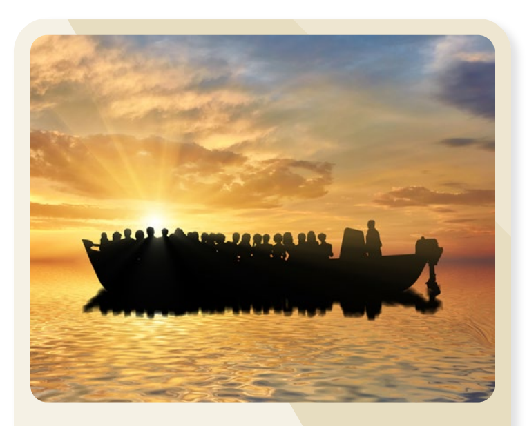
Theatre events Tickets start at $20

Event details are subject to change, but the CU Presents website will always be up to date. Click or tap below to explore your options.