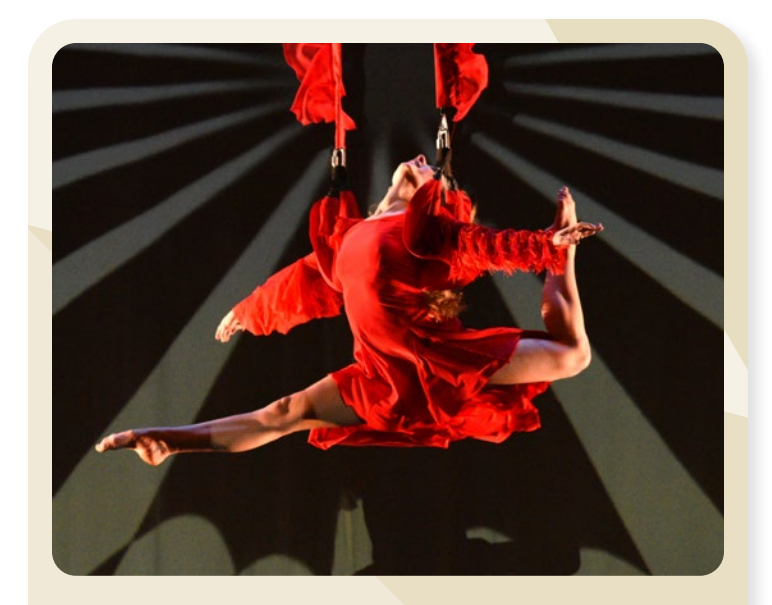
Artist Series Tickets start at $20