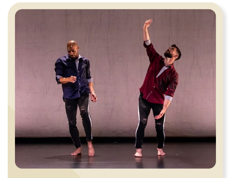
Dance events Ticket prices vary